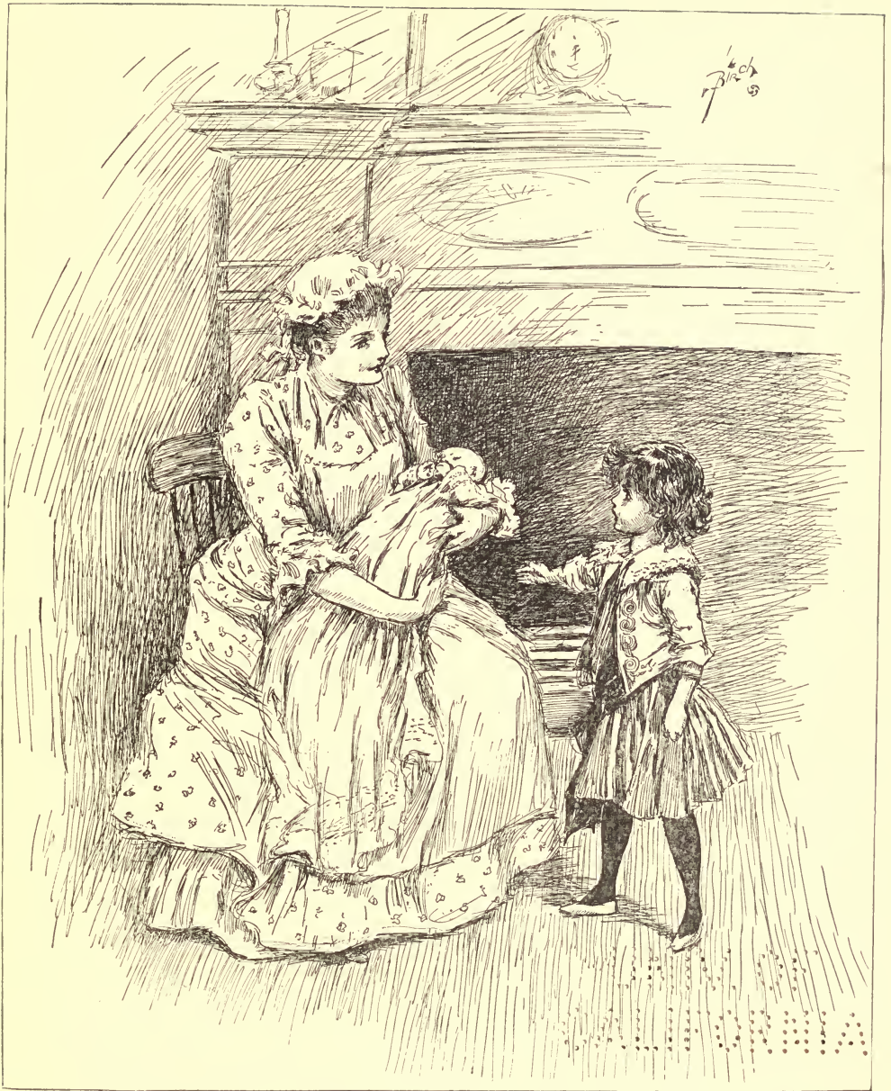
FAUNTLEROY'S WELCOME INTO THE WORLD: "F'OW HIM IN 'ER FIRE!"